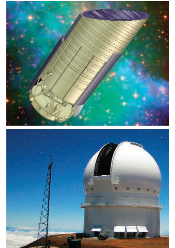
Don't look down. A proposed space telescope such as SNAP (top) faces competition from today's ground-based telescopes such as the Canada-France-Hawaii Telescope on Mauna Kea.

But even as they lay their plans for the satellite, researchers are debating whether they could hammer out key properties of dark energy with observations from the ground. NASA, DOE, and the U.S. National Science Foundation have received dozens of proposals for measuring dark energy from terra firma, and the agencies have assembled a Dark Energy Task Force to evaluate them and report back by year's end. The task